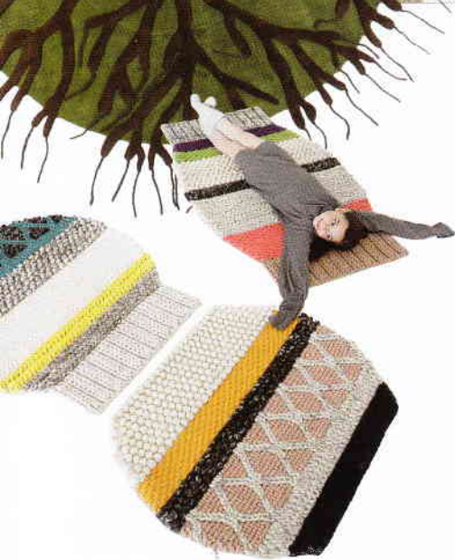
CLOCKWISE FROM BOTTOM LEFT: Designer-of-the-moment Patricia Urquiola's carpets for GAN; the Roots rug for Nodus; Leaf wallpaper of Jocelyn Warner; Up Up Up folds away and is easy to carry; Uaciró's Naturafantastic collection