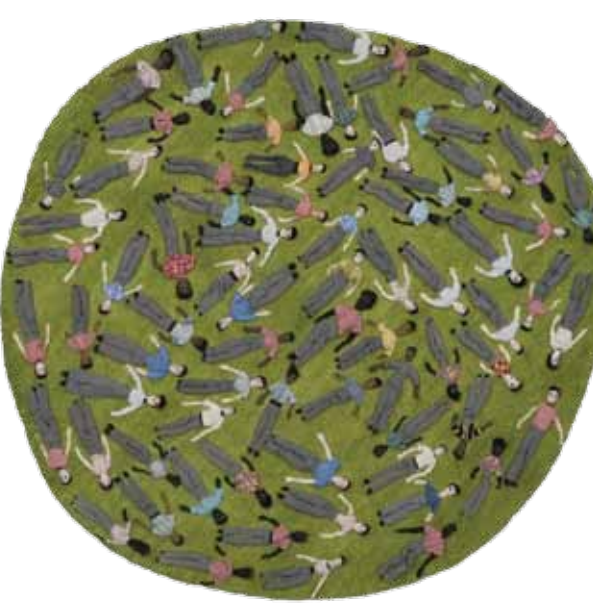
▲ Circus by Estudio Campana Hand-knotted | hemp & rag dolls | Nepal

hen the ancient knowledge of carpet design chance upon the vision of the most innovative designers and architects, rest assured a blissful marriage between design and art materialises. NODUS (nodusrug.it) is a creative and cultural lab for experimentation and projects that unites the aforementioned, bringing you exquisite pieces of hand-knotted rugs.