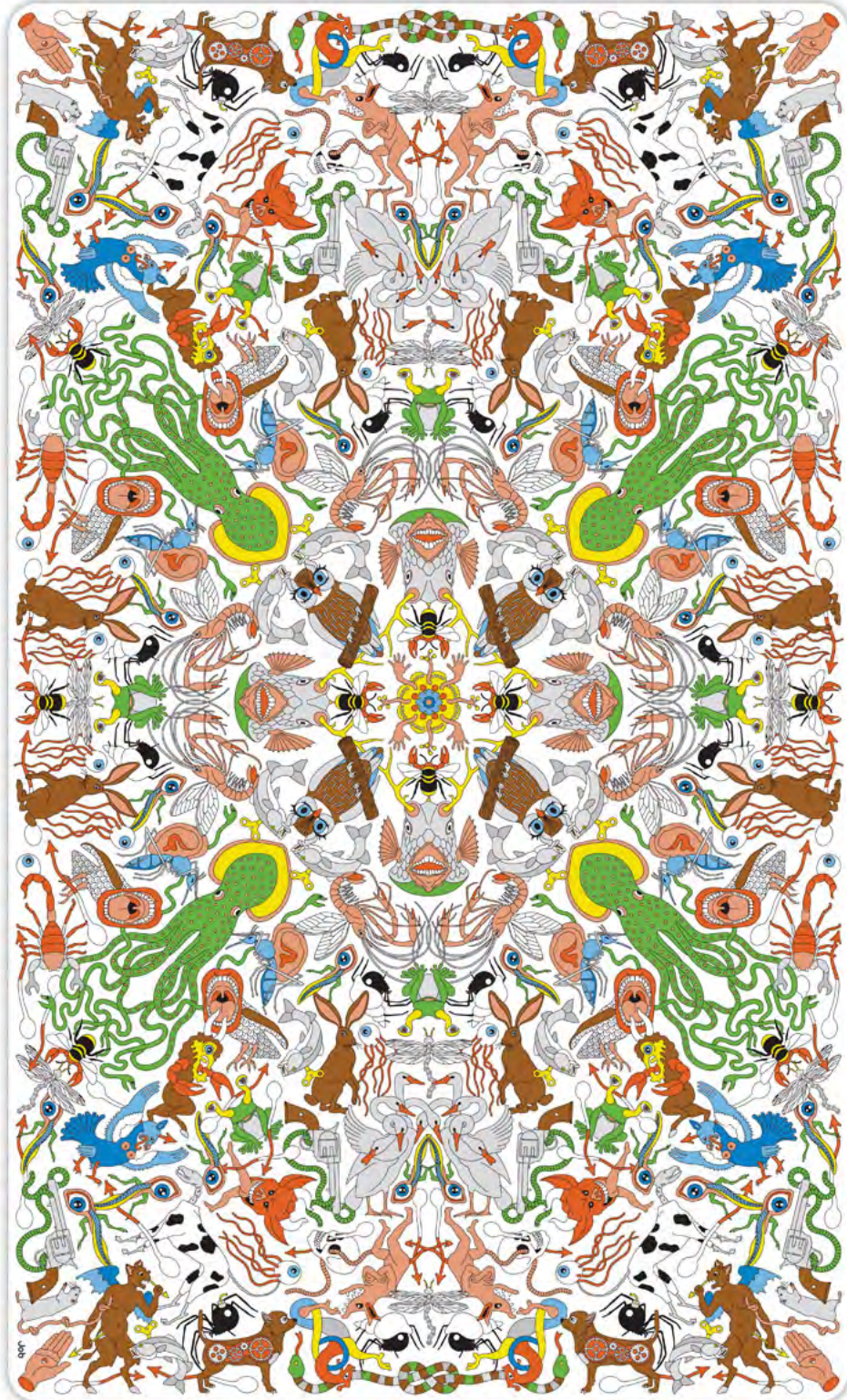
UNDERWORLD rug by Studio Job for Nodus .