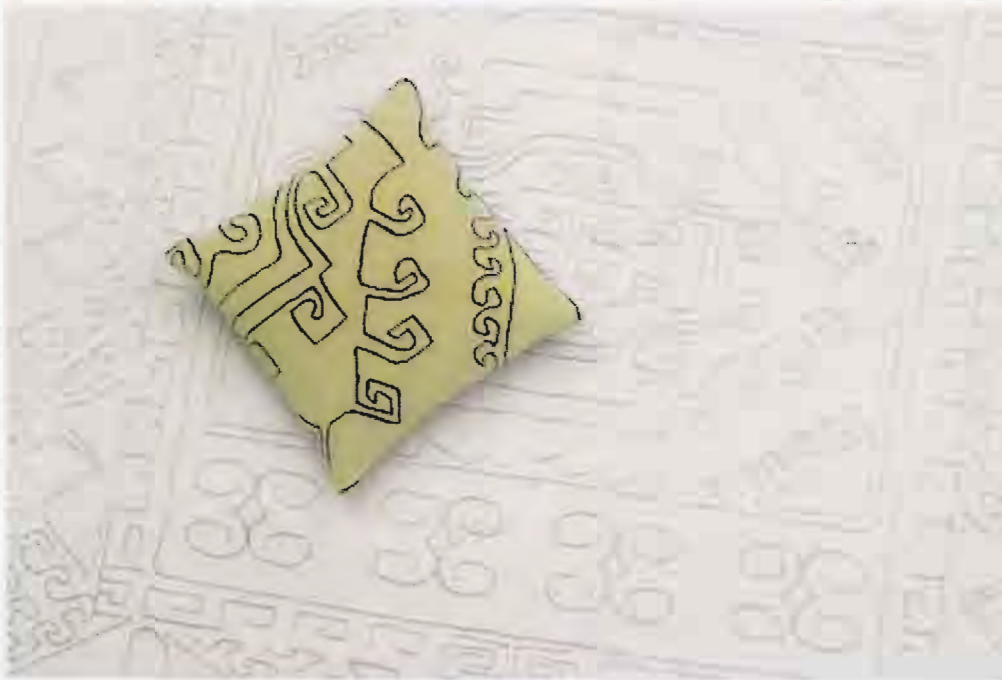
Moroccan themed Mr. Nest.