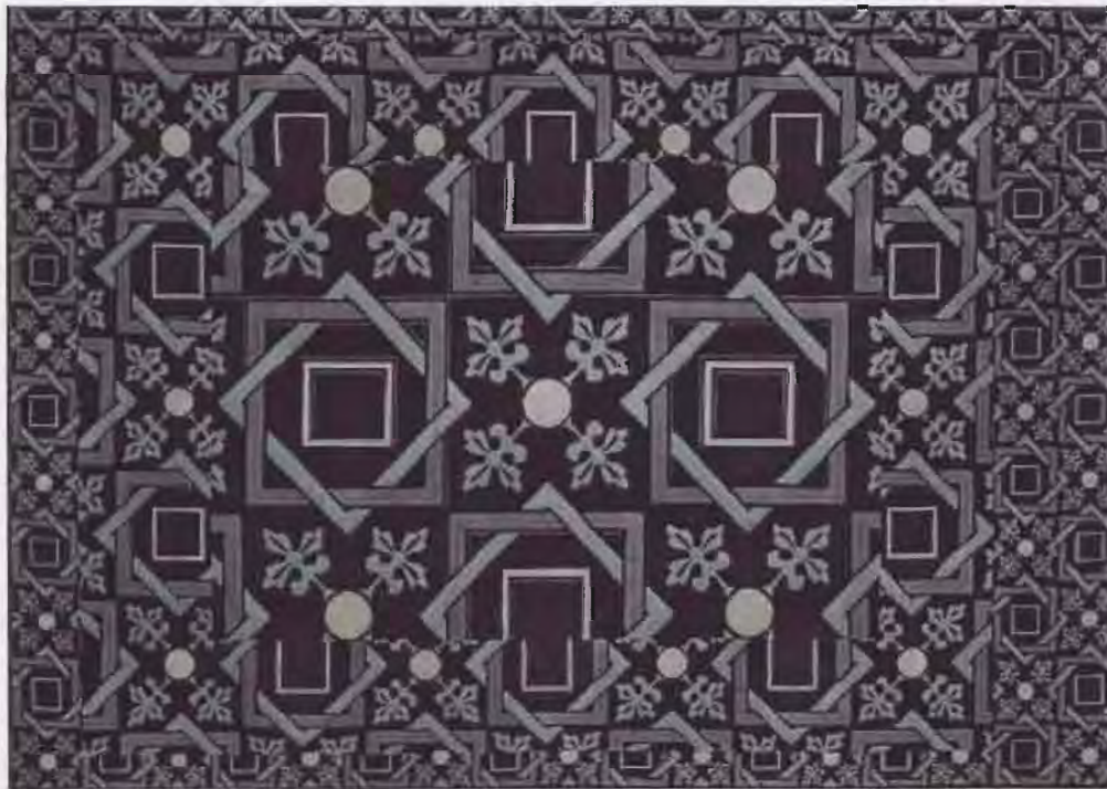
The intricate Portogallo.

Nodus does feature an array of more classic forms, like these fine specimens: