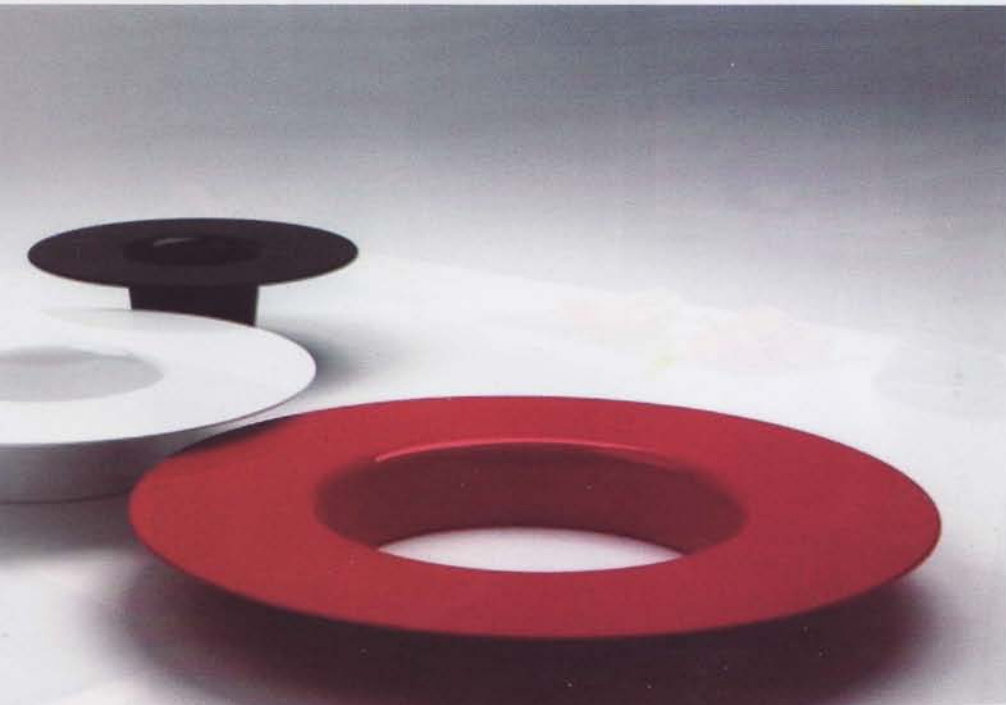
WACHER BOOM TABLES BY SERRAVALINGA

IT'S ALL ABOUT SHAPES AND PATTERNS THIS SEASON. LOOK OUT FOR SUPERNATURAL ORNAMENTAL AND TEAK GRAPHIC INSPIRED INTERIOR PRODUCTS.