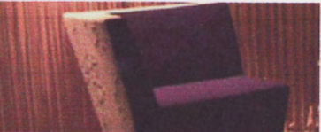
TV Stockholm Furniture Fair 2009 - Anya Sebton latest designs