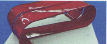
TV Imm Cologne Furniture Fair - Part two