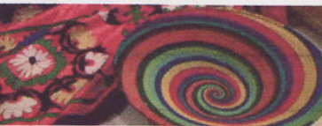
TV Maison & Objet 2008 - Exclusive interview with Vincent Grégoire of the Nelly Rodi