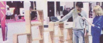
TV Meuble Paris 2009 - Via, Aide à Projet