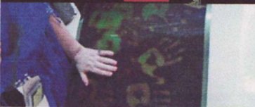
TV Meuble Paris 2009 - Innovatheque & VIA