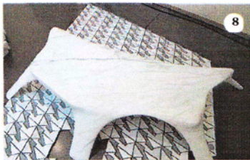
Ren Table & Tootsie Rug by Ifeanyi Oganwu