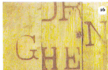
Whiskey Barrel Flooring by McKay

Text size / Masthead / Advertise / Contact / Privacy / XML Feed / © 2009 MoCo Loco